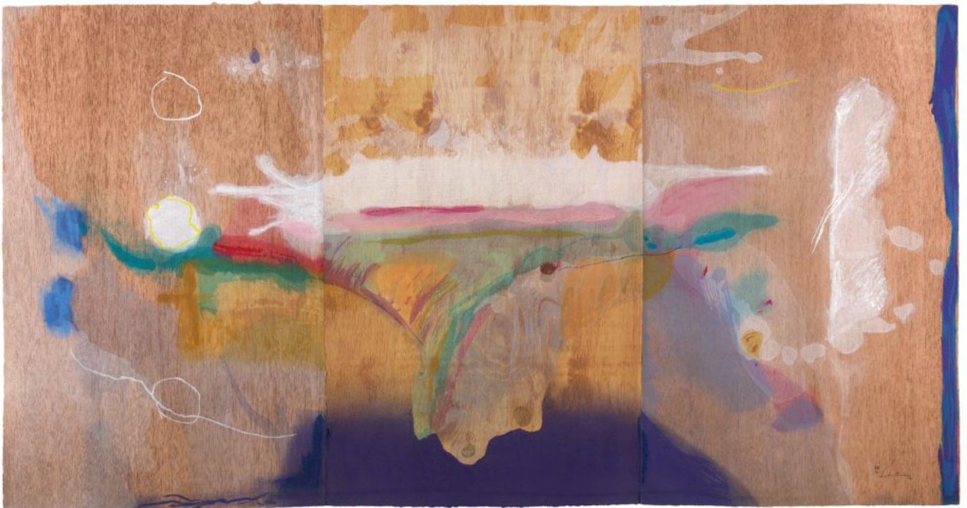
Figure 5. Helen Frankenthaler, Madame Butterfly, 2000. One-hundred-two color woodcut