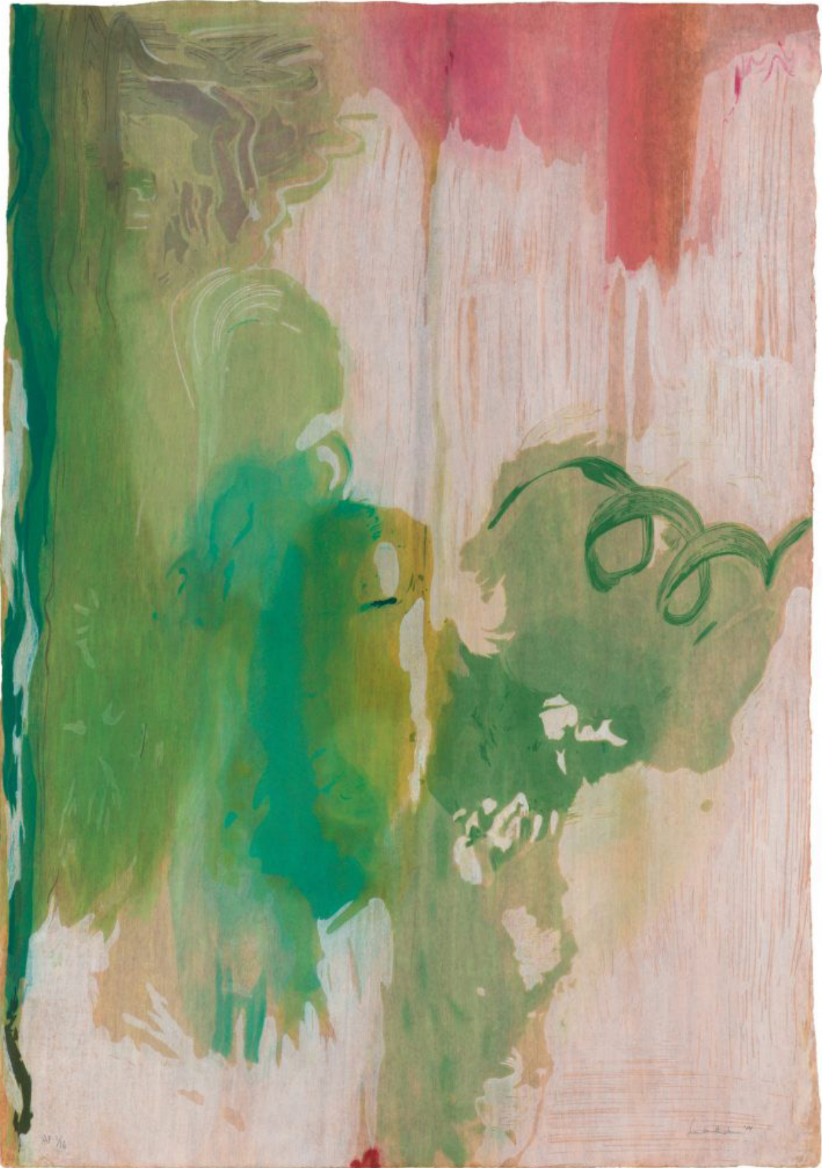
Figure 1: Helen Frankenthaler, Snow Pines, 2004. Thirty-four color woodcut © 2021 Helen Frankenthaler Foundation, Inc. / ARS, NY and DACS, London / Pace Editions, Inc., NY