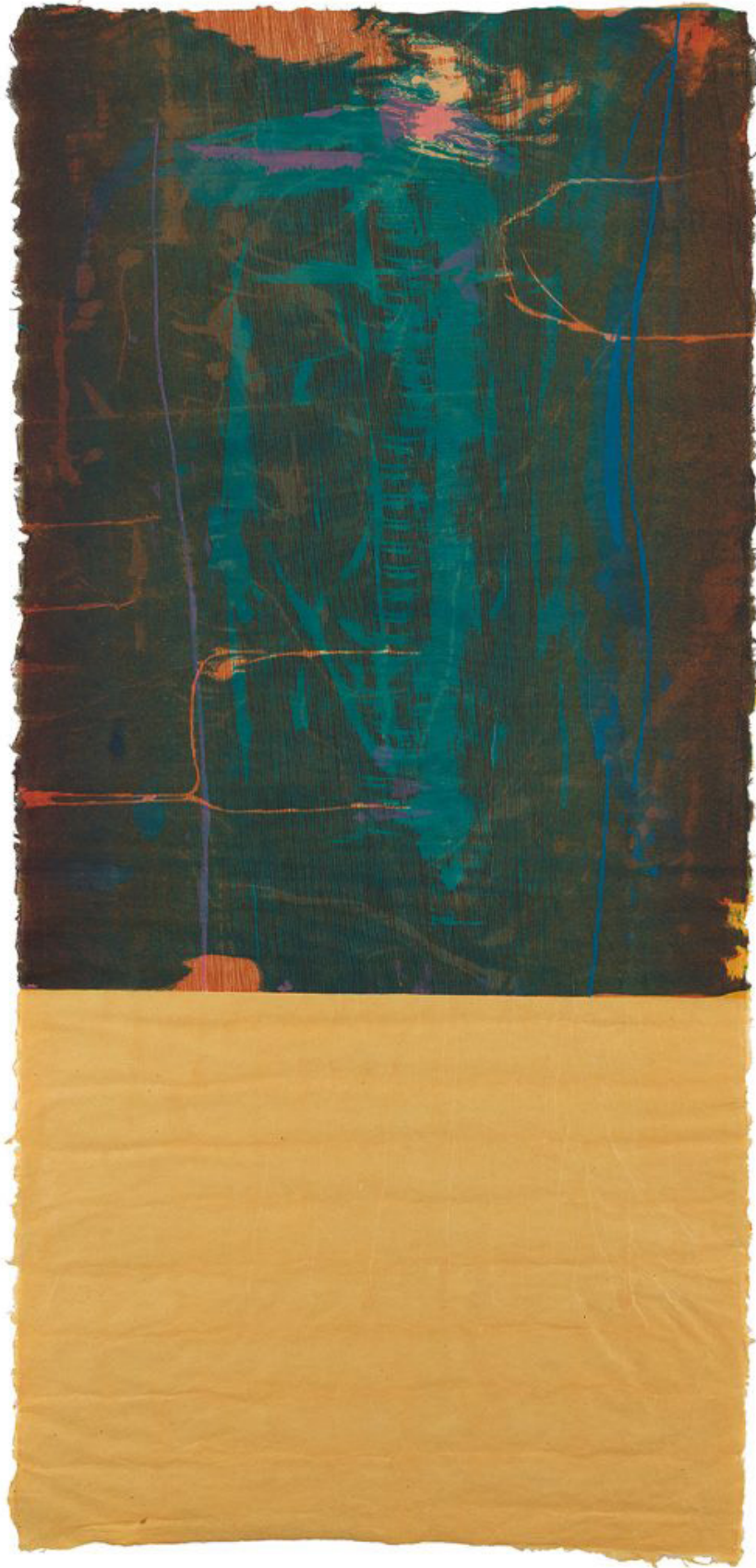
Figure 6. Helen Frankenthaler, Essence Mulberry, Trial Proof 19, 1977. Woodcut proof