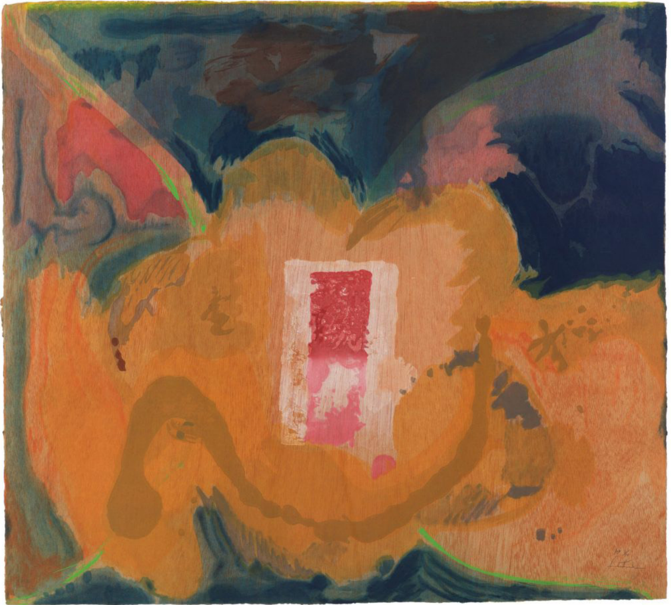
Figure 7. Helen Frankenthaler, Tales of Genji V, 1998. Forty-nine color woodcut