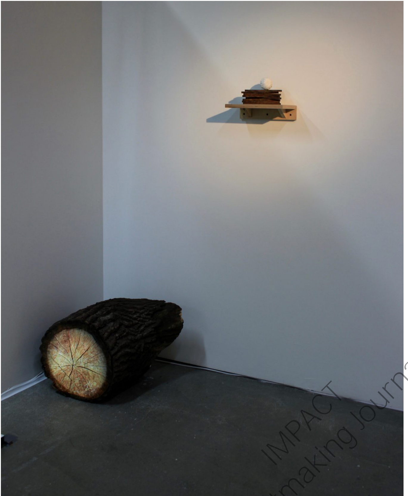
Figure 2. Areskog Jones installation 2018