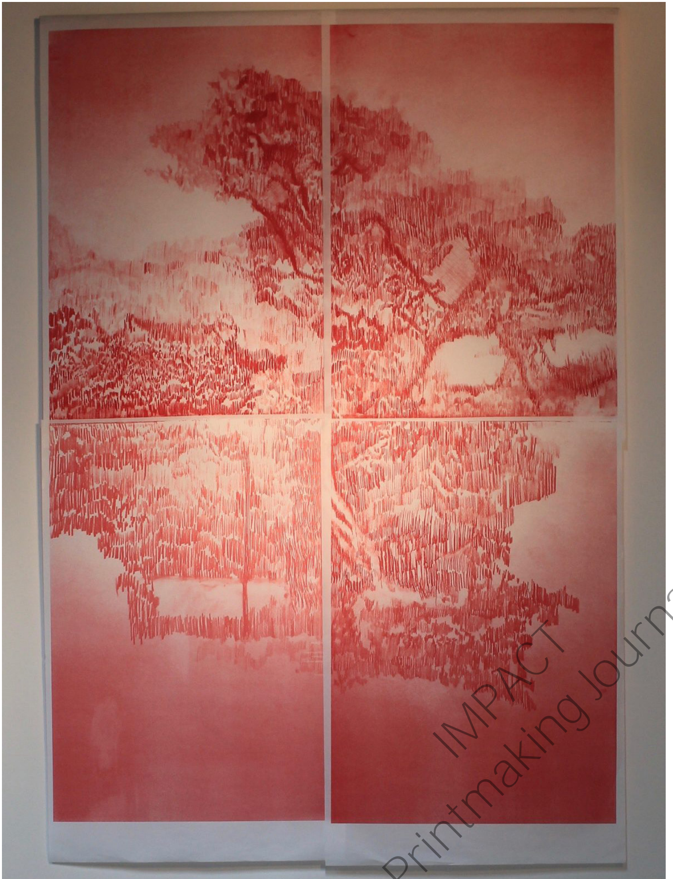
Figure 3: Red Haze: lithograph on shoji by Caroline Areskog Jones 120 x 180 cm 2019