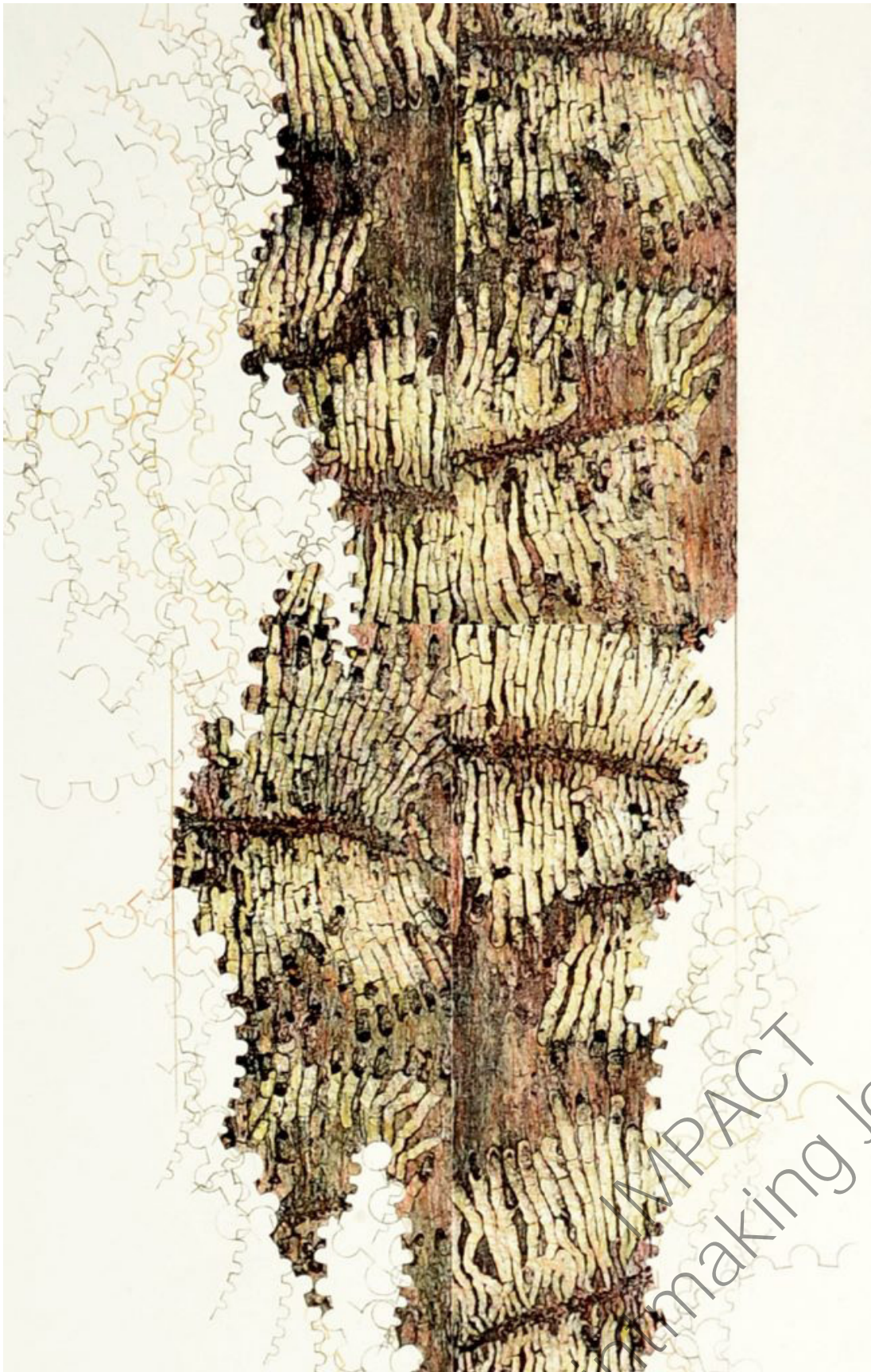
Figure 6: Ekphrasis 4, hand coloured stone lithograph, 2019, detail