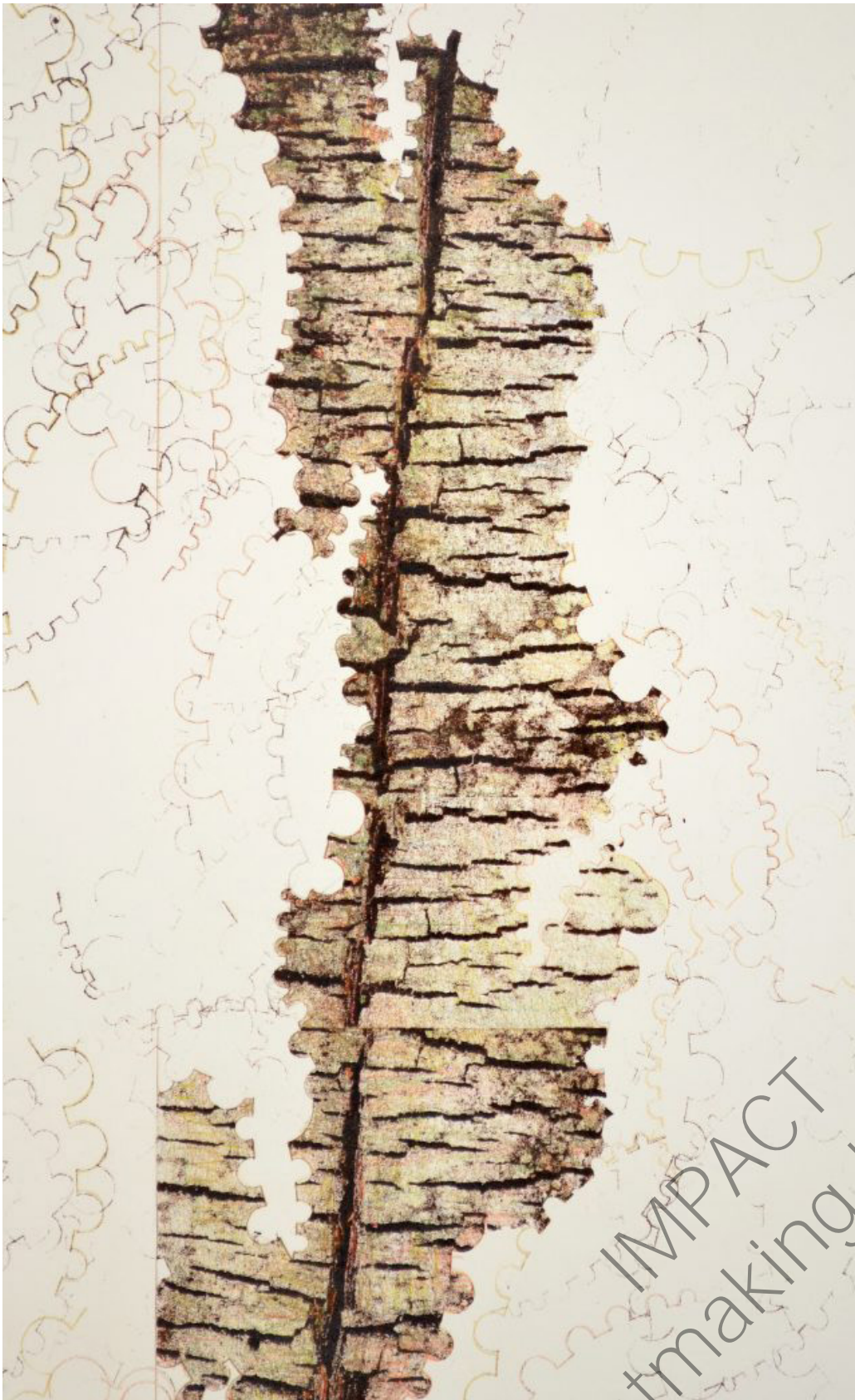
Figure 10: Ekphrasis 7, Hand coloured stone lithograph, 2019