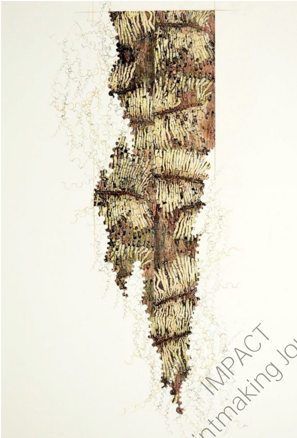
Figure 5: Ekphrasis 4, hand coloured stone lithograph, 2019