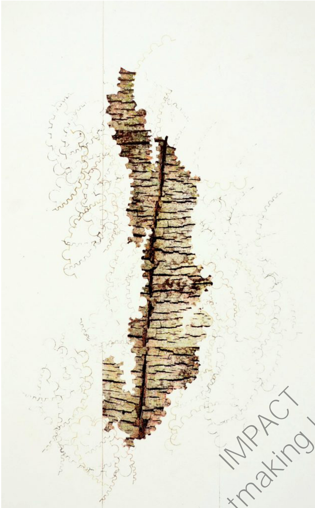
Figure 9: Ekphrasis 7, hand coloured stone lithograph, 2019, detail