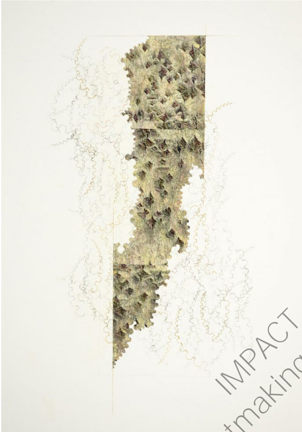
Figure 1: Ekphrasis 1, Hand coloured stone lithograph, 2019