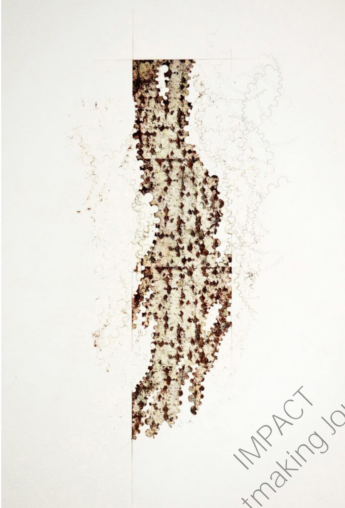
Figure 3: Ekphrasis 3, hand coloured stone lithograph, 2019