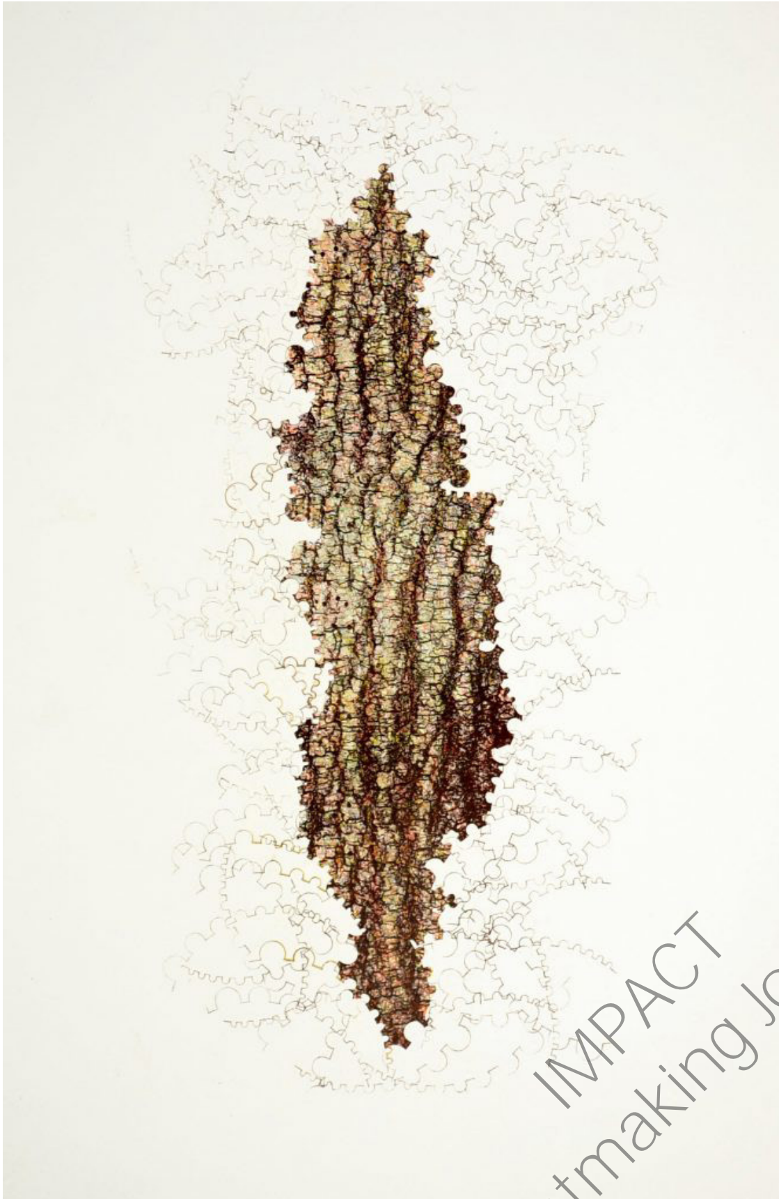
Figure 7: Ekphrasis 6, hand coloured stone lithograph, 2019