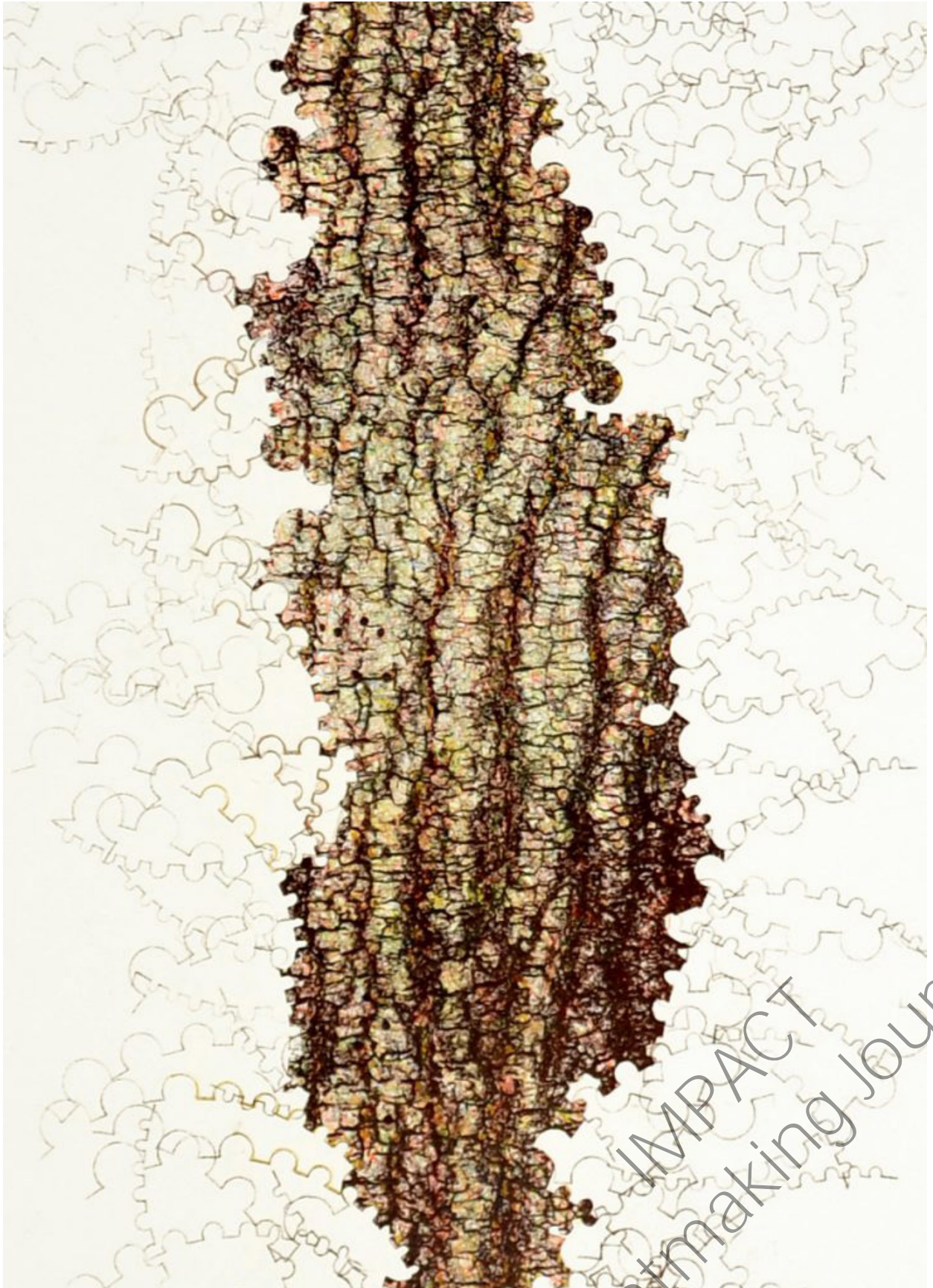
Figure 8: Ekphrasis 6, hand coloured stone lithograph, 2019, detail