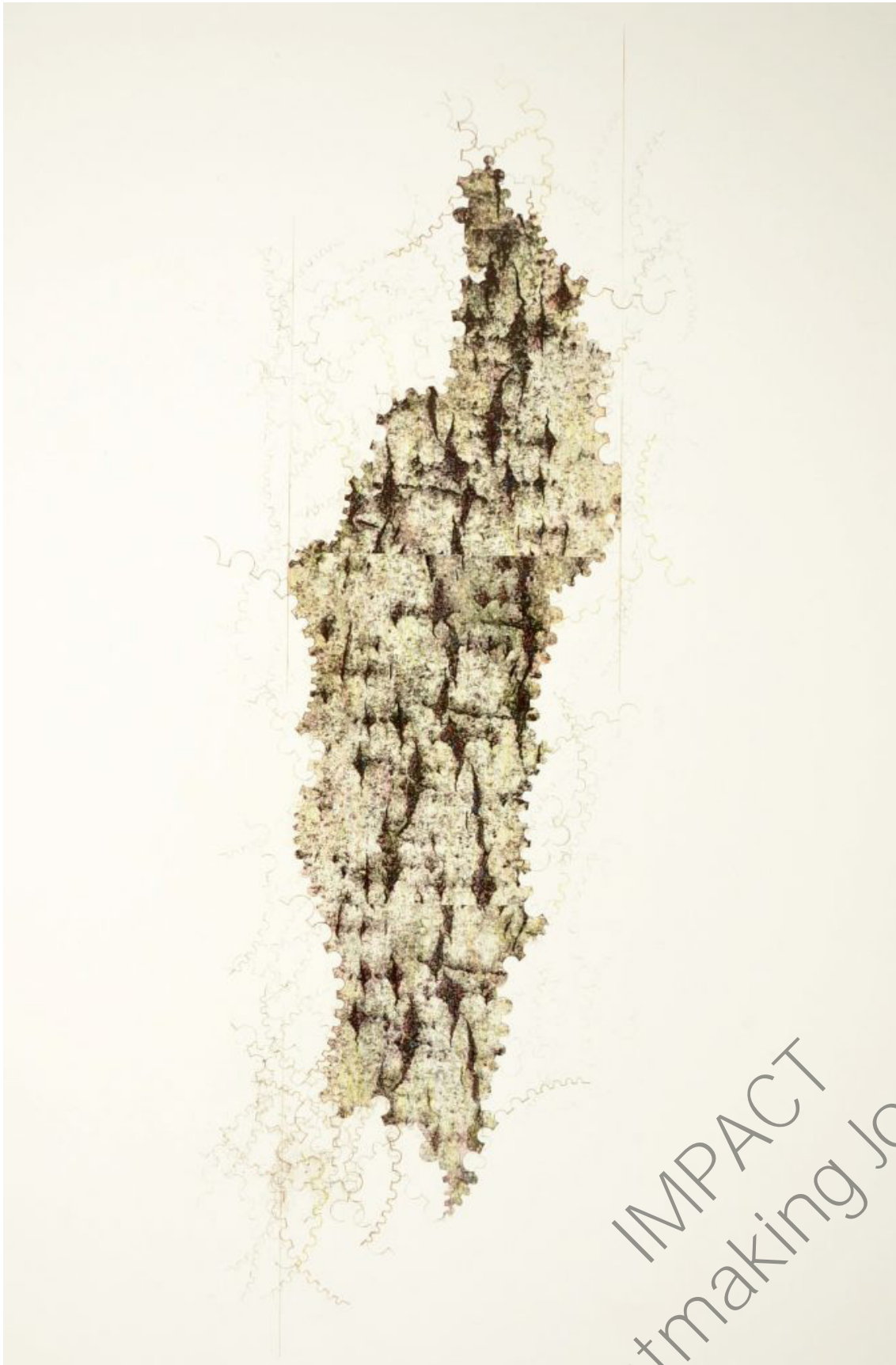
Figure 2: Ekphrasis 2, Hand coloured stone lithograph, 2019