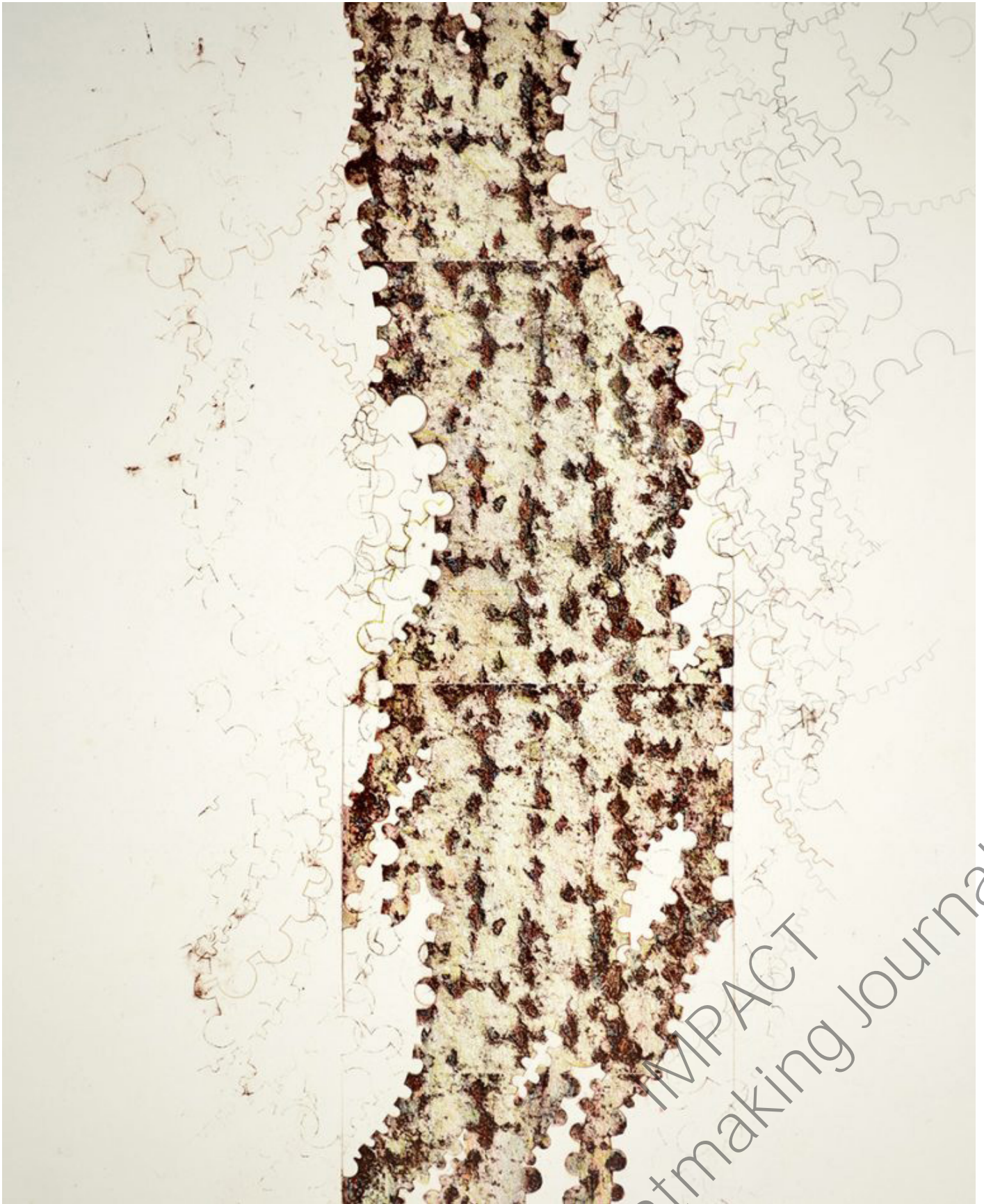
Figure 4: Ekphrasis 3, hand coloured stone lithograph, 2019, detail