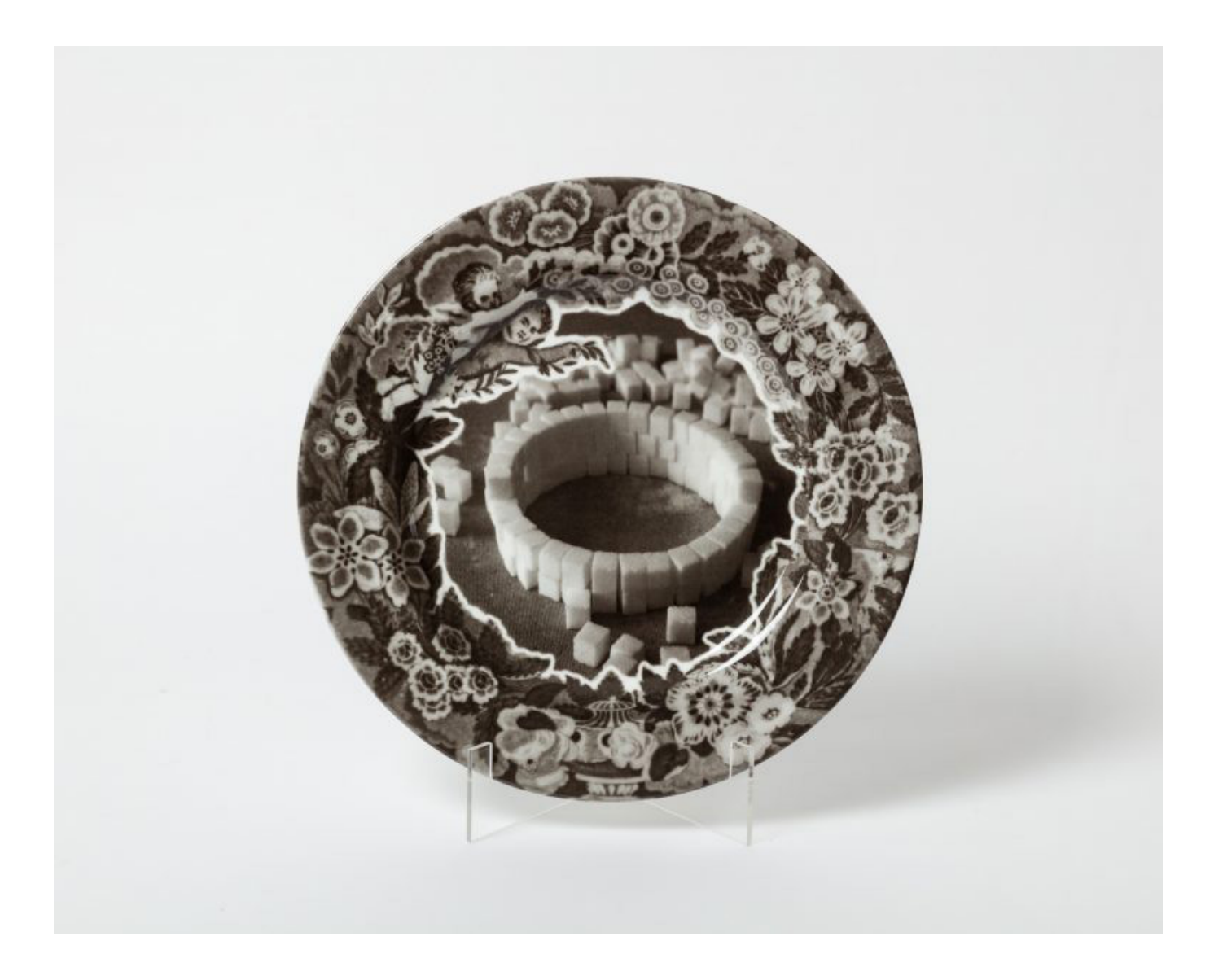
Figure 3. Scenes from the Kitchens I–XX 2019 Digitally printed ceramic Series of 20 plates; each 22cm in diameter