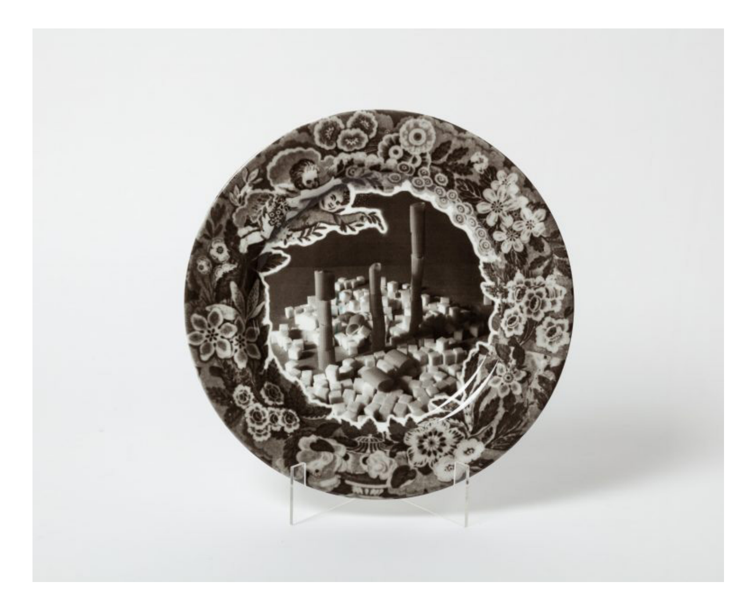
Figure 4. Scenes from the Kitchens I–XX 2019 Digitally printed ceramic Series of 20 plates; each 22cm in diameter