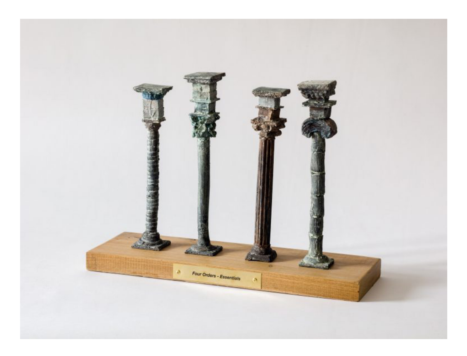
Figure 2. Four Orders – Essentials 2018 Bronze 15 x 50 x 36 cm