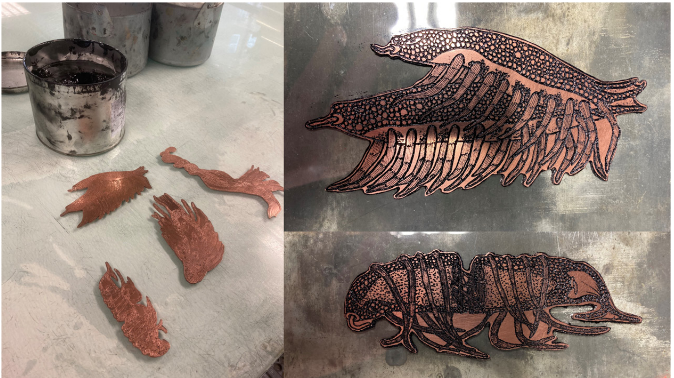
Figure 3: Rae-Yen Song, 'ah kong --ghost--', 2022. Laser-cut woodblock print with screen-printing and additions of embossing powders and holographic vinyl on Somerset Velvet White 400gsm paper, 99 x 101.4cm, edition of 5. Figure 4: Photo etched copper plates during development process for Rae-Yen Song print editions.