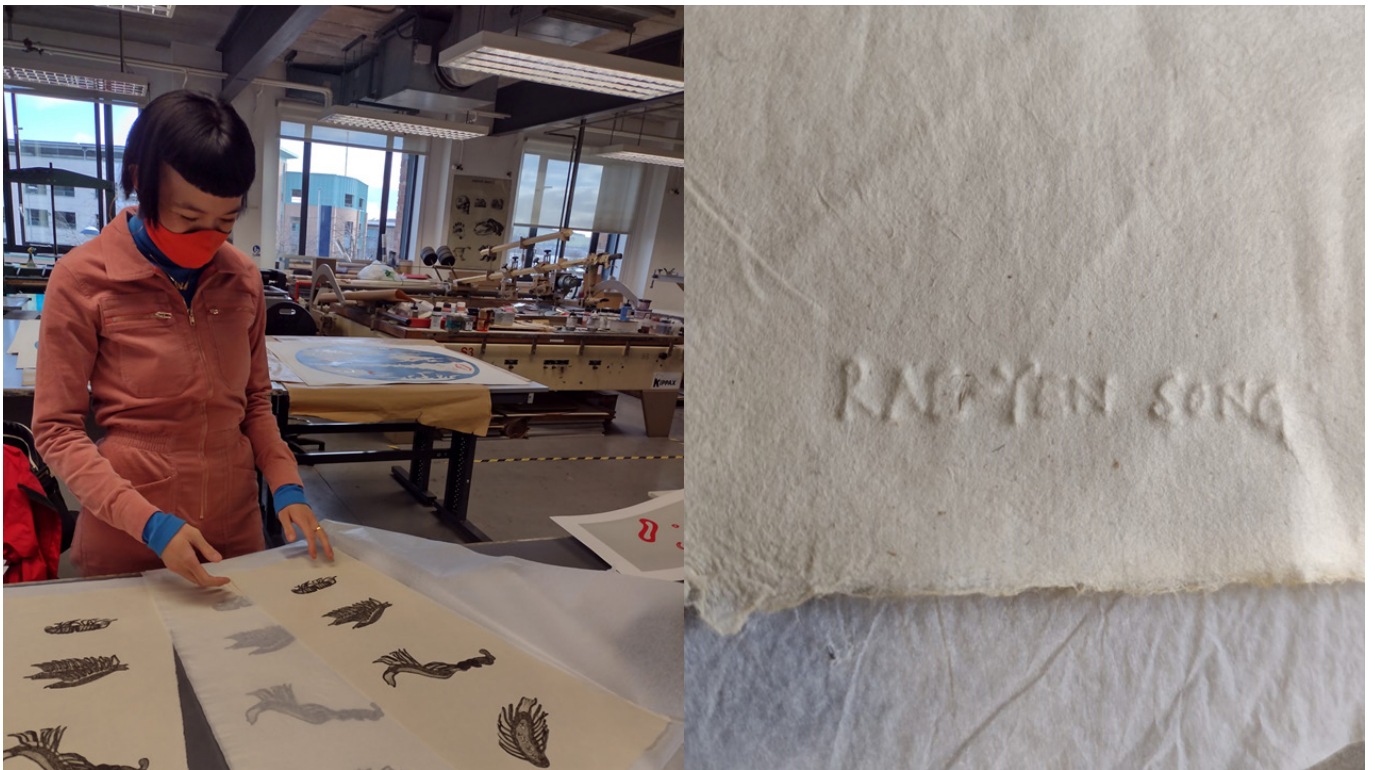
Figure 5: Rae-Yen Song, 'vessel', 2022 Four plate copper etching on Atsu-Shi 76gsm paper, 66 x 25cm, edition of 20.