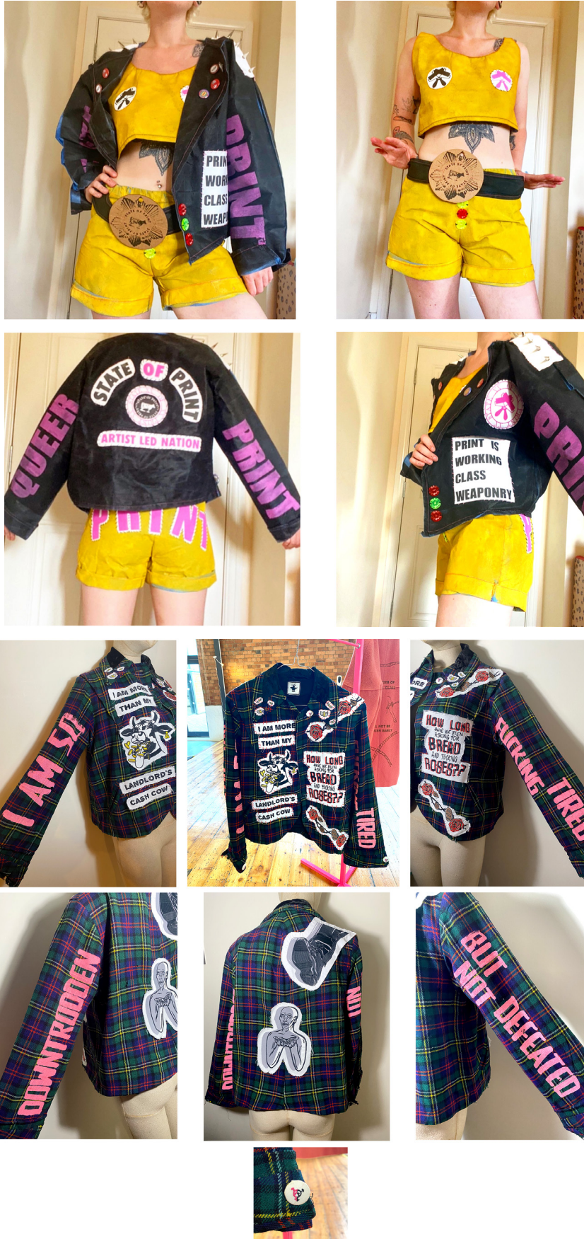
Figure 9: State of Print outfit