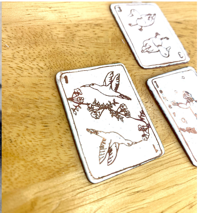
Figure 5: Stone lithograph process. 2022.