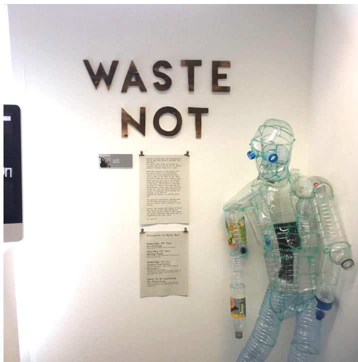
Figure titles and information: